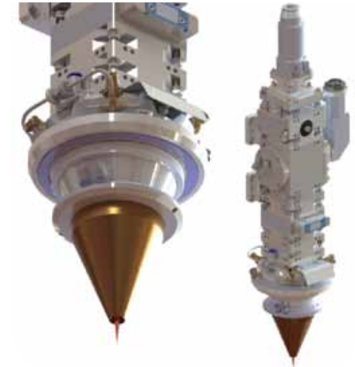
FIGURE 2. The YC52 cladding head with a coaxial nozzle.

In 2009, a system was built in Port Talbot, South Wales, UK, in an attempt to develop laser cladding for coating critical works components to increase their service lifetime (FIGURE 1). In the rolling mills of the steel industry, different rolls of 0.3 to 3.5 meters in length are needed. Laser