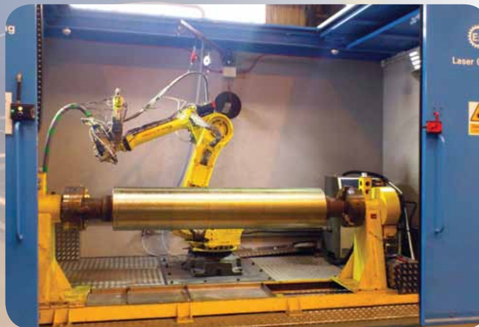
FIGURE 1. The production laser cladding facility at Tata Steel Strip Products UK.

The laser cladding process is a method of hardfacing that can be used to increase the wear / corrosion / impact performance of metallic components. The process utilizes a precisely focused high-power laser beam to create a weld pool into which a metallic powder is applied. The powder is carried by a stream of inert shielding gas and is blown coaxially through the laser beam. The accurate nature of the laser beam allows fully dense cladding with minimal dilution (<5%), yet with a perfect metallurgical bond. Numerous coatings can be applied, the composition of which can be designed to combat