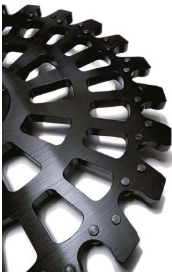
The indexed star wheel of an inspection machine receives articles from a conveyor and performs a rotate-and-stop cycle. Each time the wheel stops, static measuring heads perform one of a number of tests, checking parameters such as wall thickness.