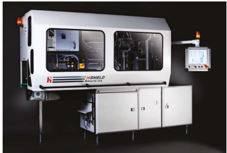
Heye International's SmartLine series of cold end inspection equipment employs the benefits of the contactless chromatic confocal measuring technique.

Wall thickness is one of many important parameters monitored constantly by fully automatic inspection equipment at the cold end when manufacturing lightweight glass containers. Complex star wheel or stop-and-rotate inspection machines employ an indexed star wheel, with pockets into which the containers fit; during each pause in position, various checks are performed. The wall thickness of every item is inspected by chromatic confocal sensors. Checking that the wall is not too thin at any point requires measurements at a number of positions on the bottle, where the wall is most likely to fall below acceptable limits. Experience shows that this will be on the shoulder or heel of the bottle.