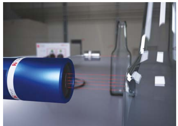
A multi-point sensor simultaneously measuring the container's wall thickness at five points. The measurement points are arranged along a line 1cm in length (image: Heye International).

The sensors downstream of the special measuring heads support up to 12 individual points that can be measured in parallel. This sensor technology can again be retrofitted to existing star wheel machines. This allows the benefits of the contactless chromatic confocal measuring technique to be extended into other areas of application. Together with the additional container properties testing provided by Heye's SmartLine product range, which can comprise up to six inspection units, this technology becomes an essential prerequisite for ensuring that glass producers are able to meet the ever-increasing demands imposed by bottlers. ■