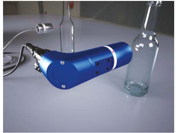
Multi-point measurement system with chromatic confocal sensor for measuring the wall thickness of glass containers. A single-point sensor is shown in the background in the right-hand image.

that defeat other 3D measurement processes.